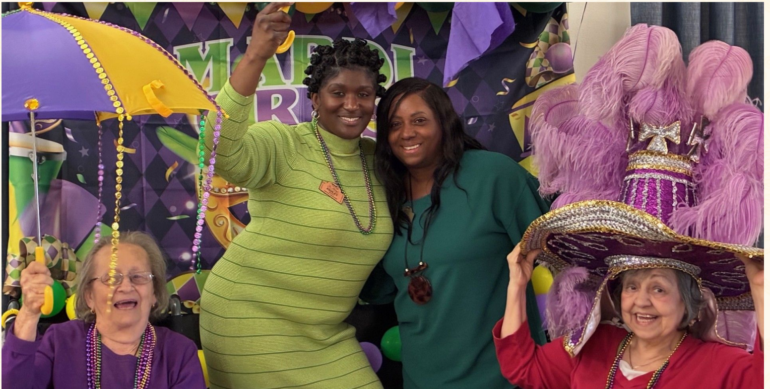
Laissez les bon temps rouler!