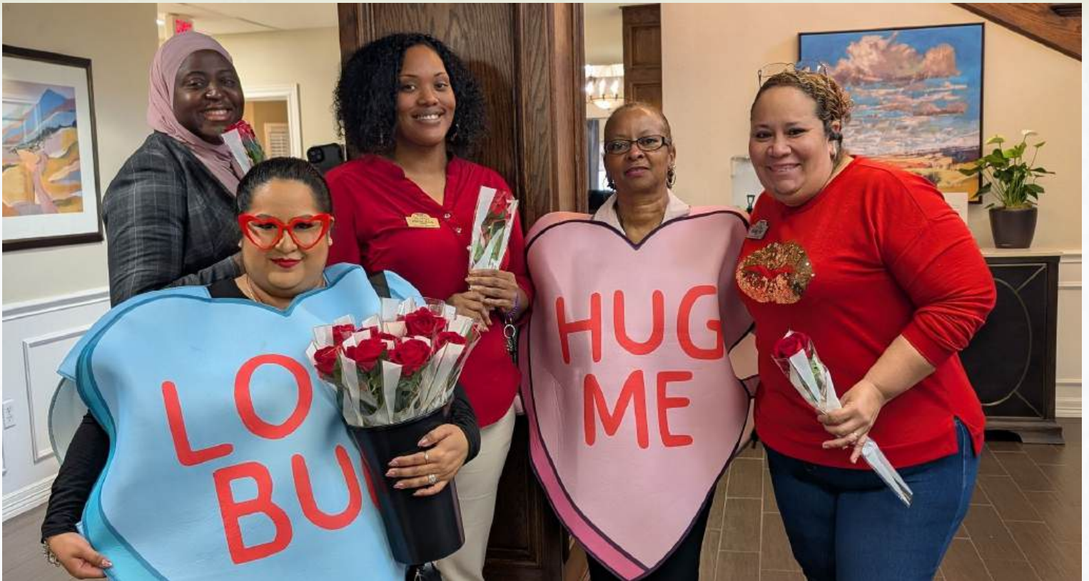
Valentine's Day 2025