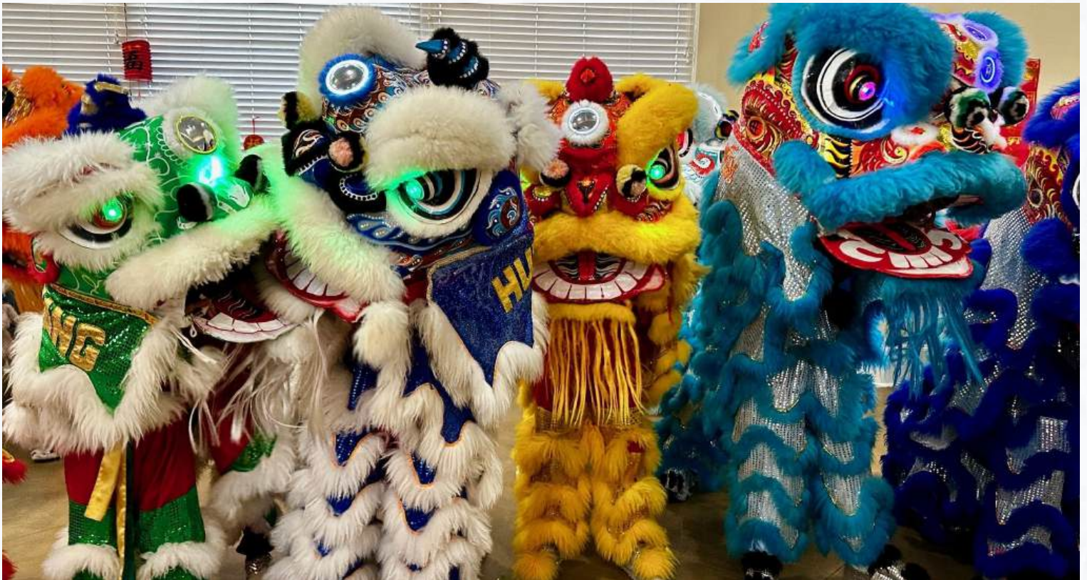
Chinese New Year - 2025, Year of the Snake