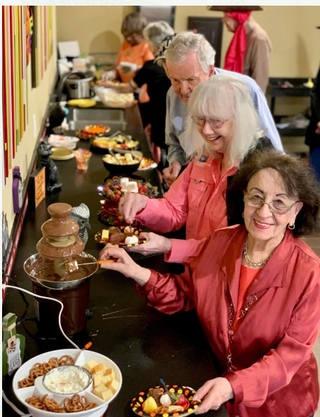
Chocolate Fondue Party