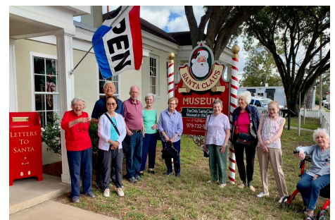
Santa Claus Museum