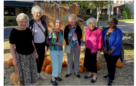
"Hearts & Hands" Holiday Market at Memorial Drive United Methodist Church