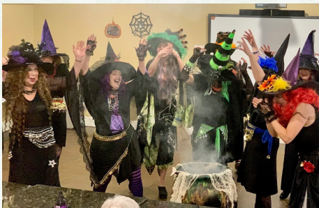
The Real Witch Wives of Houston