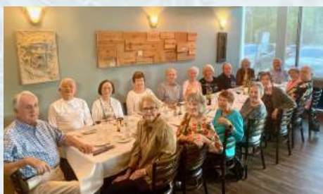
Dine Around "Cafe Benedicte"