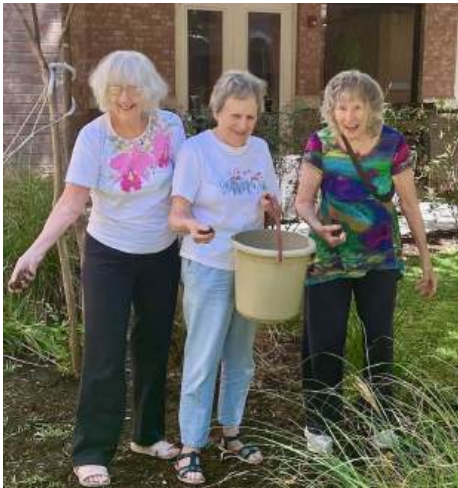
Scattering wildflower seeds

We express our gratitude to the Garden Club members and all those people who contribute to the beauty of our courtyard garden!