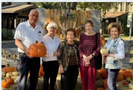
"Hearts & Hands" Holiday Market at MDUMC