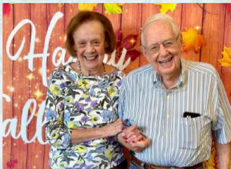
Sweet September Happy Hour