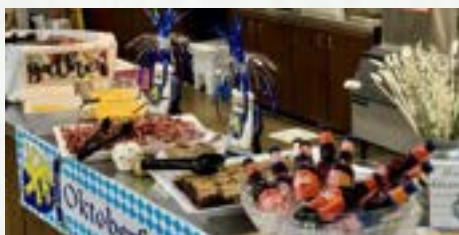
COMMUNITY WIDE OKTOBERFEST