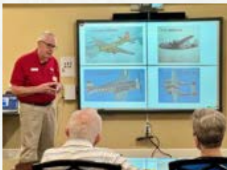
LONE STAR FLIGHT MUSEUM PRESENTATION