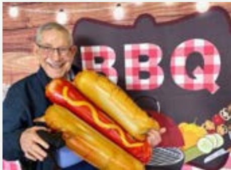
AUTUMN BBQ PARTY