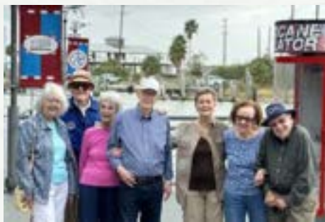
TRIP TO KEMAH BOARDWALK