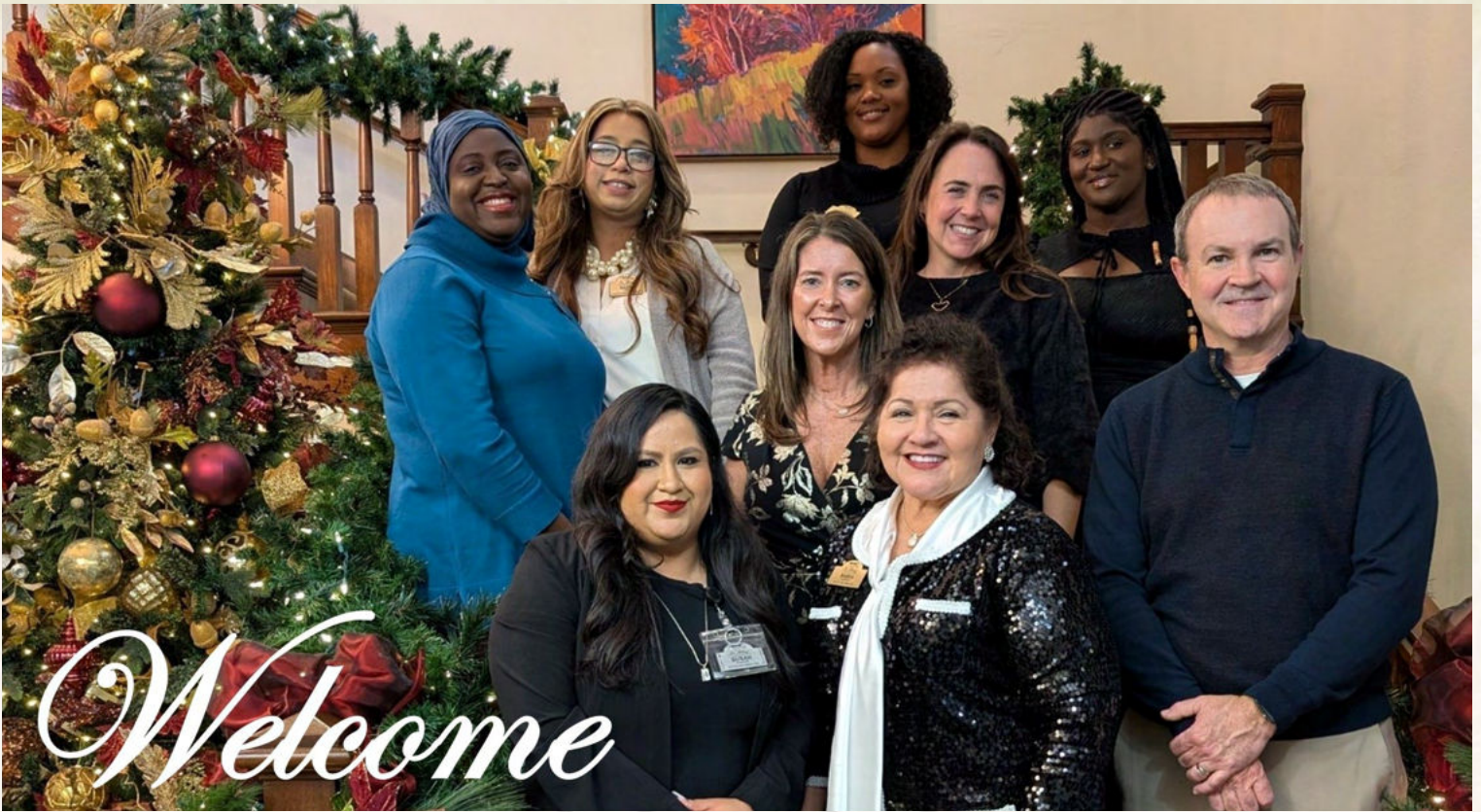
Happy Holidays from the Lake family & staff!